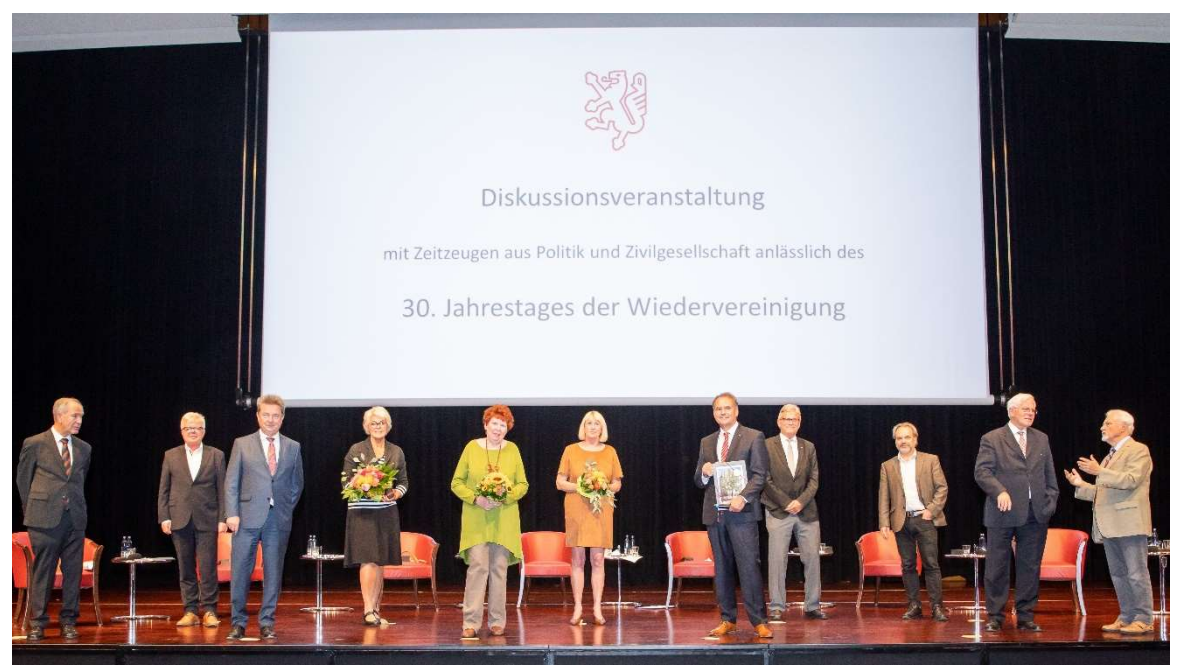
The moderator and the Lord mayor with the witnesses at the closure of the event

To mark the 30th anniversary of the reunification of the two German states on October 3, 1990, politicians and representatives of civil society shared their views in a panel discussion on October 2. Around 150 citizens, among them a number of pupils, attended this event.