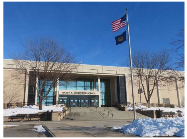
Harry A. Burke High School Omaha

Unfortunately, no activity with the friendship city Omaha could be conducted in 2020. Thus, the youth exchanges organised by the Department of Children, Youth and Families, which take place in close cooperation with Braunschweig's Raabeschule High School and the Harry A. Burke High School in Omaha, could not take place. The student exchange between Hoffmann-von-Fallersleben School and Omaha North High Magnet School was also cancelled.