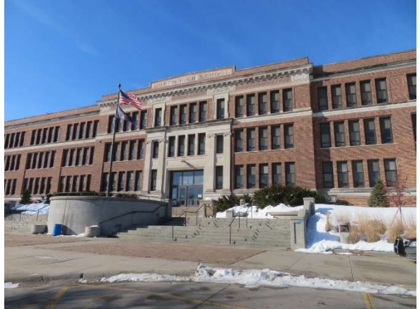
Omaha North High Magnet School