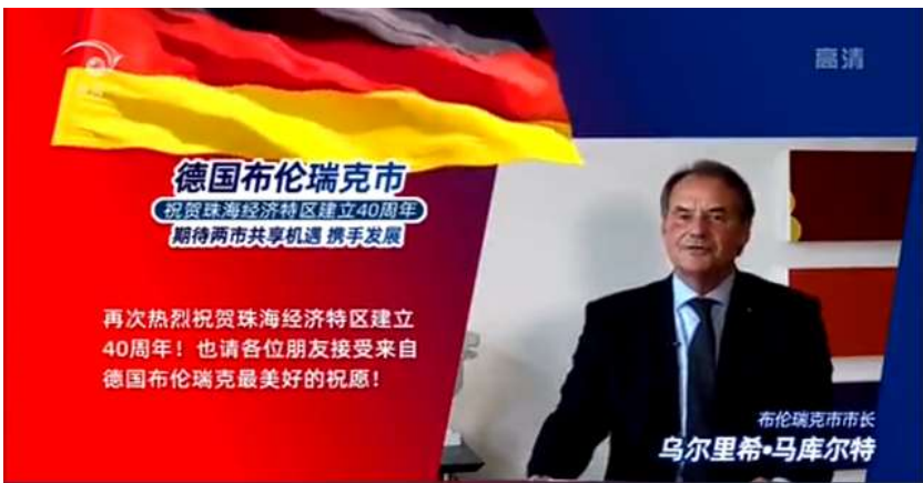
A still from the TV-show

Extracts of the greeting message and of the promotional film on Braunschweig were also shown on local television.