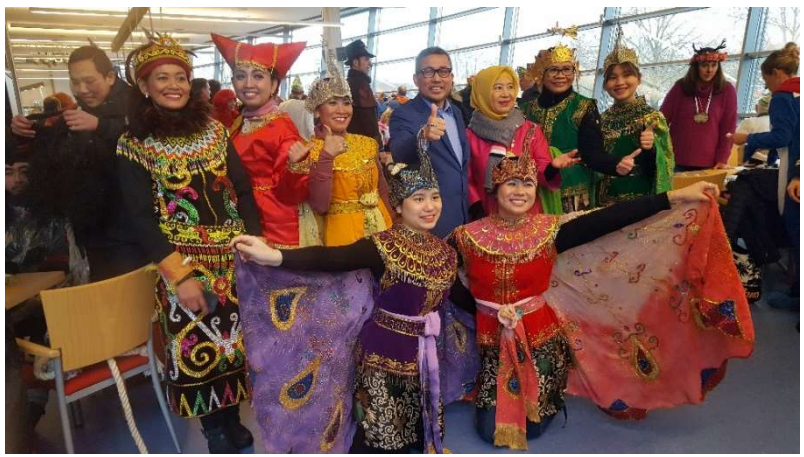
The Indonesian guests at the reception held by the marshal of the carnival parade in the Volkswagen Hall