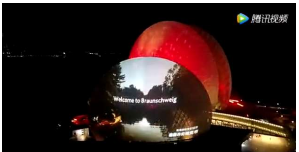
Lord Mayor Markurth`s video message and the promotional Film "Löwenstadt" were displayed on the shell-shaped Zhuhai Opera House building.

Extracts of the greeting message and of the promotional film on Braunschweig were also shown on local television.