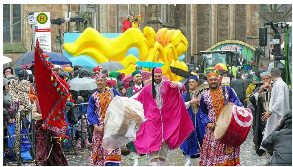
The Musicians from Sousse putting the heat on the spectators.

on 23 February 2020 was part of the agenda. The Tunisians presented themselves on a specially decorated parade float. The folk group who had already played music at the above mentioned ceremony, accompanied the parade float on foot.